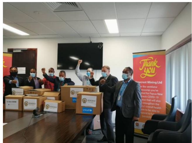
Photos 1-2. NDoH/ NCC were handed over ventilator accessories from UNICEF supported by Newcrest Mining Limited on 16 December.