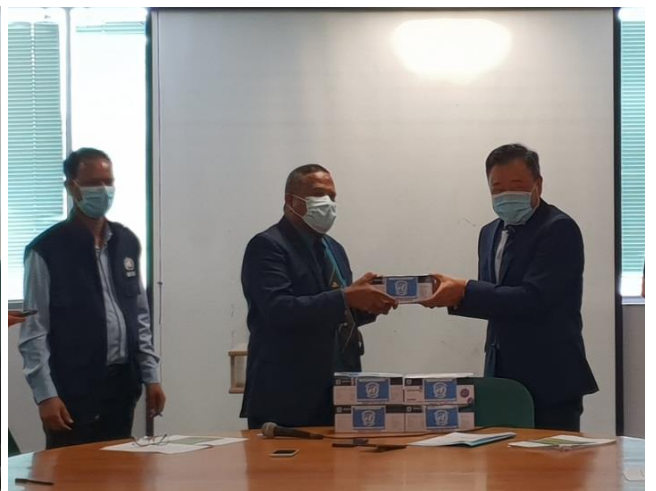
Photos 3-4. NDoH/ NCC received Ag-RDT from WHO on 22 December. These test kits will be used across PNG to increase COVID-19 testing rates and help reduce turnaround time.

----- For more information about this Situation Report, contact: